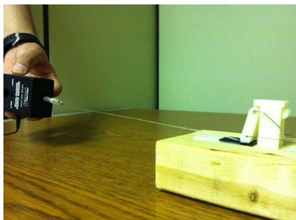
Fig. 3 The experimental setup to examine the locking mechanism

The full setup is shown in figure (3). A suture was placed under the peg and a current was applied to the SMA wire. The suture was then pulled by hand using a linear force gauge to record the highest force the suture was subjected to until it moved.