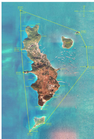
Fig. 1 Sichang Island and Harbor boundary