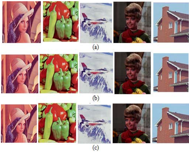
Fig. 4 Compressed images visual performance of the proposed method (A-2): a) DCT block size is 8 \times 8 , b) DCT block size is 16 \times 16 and c) DCT block size is 32 \times 32

The CR results of the proposed method (A-3) and the other compared methods MHC scheme [17] are presented in Fig. 6. The A-3 obtains 35.33 on average and the best performance (41.0029) in House. Compared with CBDCT-CABS [18], the A-3 achieves 2.8334 dB higher average performances in PSNR, especially in Airplane the improvement is up to 4.15 dB. The A-3 also performs high better by 2.27 dB on average than the most competitive method of JPEG (as shown in Fig. 7).