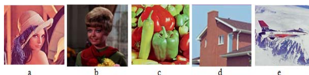
Fig. 2 Original test images: (a) Lena, (b) Zelda, (c) Fruit, (d) House and (e) Airplane

From the results listed in Table I, the proposed codec achieves a high performance, and we can conclude that about 0.1299-0.3404-bit rate reduction on average is achievable by using the proposed method (A-3). The subjective visual quality is compared using a different color image, as shown in Figs. 3, 4, 5, respectively. Figs. 3 (c), 4 (c), and 5 (c) show less block artifact than resulted image by A-3 with block size 8x8 in Figs. 3 (a), 4 (a), and 5 (a).