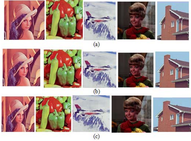
Fig. 5 Compressed images visual performance of the proposed method (A-3): a) DCT block size is 8 \times 8 , b) DCT block size is 16 \times 16 and c) DCT block size is 32 \times 32