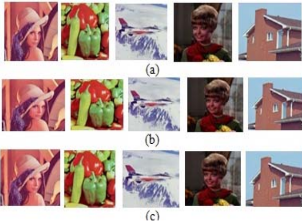
Fig. 3 Compressed images visual performance of the proposed method (A-1): a) DCT block size is 8 \times 8 , b) DCT block size is 16 \times 16 and c) DCT block size is 32 \times 32