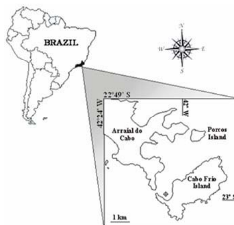
Fig. 1 The studied site showing the sampling location

Dominant E-NE winds are influenced by tropical maritime anticyclones due to the Coriolis Effect and Ekman transport, which shunt nutrient-depleted surface water (Brazil Current) offshore [18]. This water body is followed by up-flowing, nutrient-rich (12 \mu MLNO 3 -N), deeper South Atlantic Central Water (SACW), which comes from around 200–300m depth and reaches the surface sporadically. An inverse pattern can be caused by S-SW winds because cold fronts drive the oligotrophic Brazil Current (<1 \mu M-LNO 3 -N) toward the coast. As SACW is heated in the euphotic layer, nitrate declines more rapidly than phosphate, and the N/P ratio declines [19]. These processes generate different habitat conditions that influence at the same time changes in community and trophic structure [20].