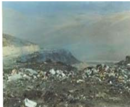
Fig. 7 View of uncontrolled dumping of wastes in landfill site

Unfortunately, at the site, some people collect valuable components of MSW informally. In addition, different types of animals such as dogs and cows consume organic components of the waste. Such inadequate disposal practices lead to problems that impair human and animal health (Figs. 7, 8).