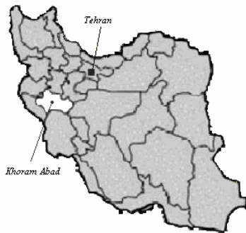
Fig. 1 The location of Lorestan province and Khoram Abad city in Iran

Khoram Abad has a main municipality that is responsible for all aspects of solid waste management.