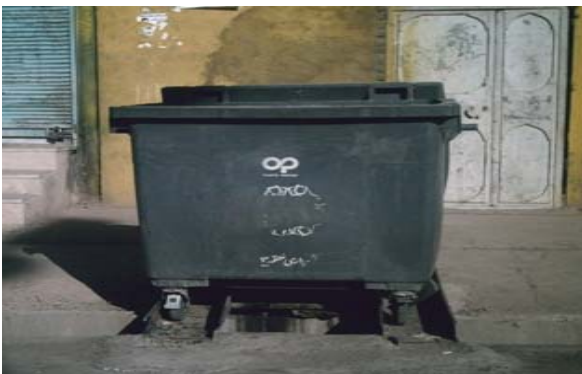
Fig. 4 Type of mechanical container for MSW collection in main streets and commercial areas, Khoram Abad

Like many other developing countries, scavenging plays a role in reducing the quantity of waste reaching the disposal site. Although scavenging activities reduce waste volume, they make waste collection much more difficult due to the opening of garbage bags. The valuable components of MSW, such as papers, plastics (PET, PP, PE, etc.), glass, metals and breads are collected by some people irregularly in the city, as well as at the disposal site. They sell the recovered materials to small recycling units.