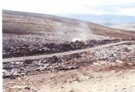
Fig. 8 Wastes disposal around the road and waste burning in landfill site

Some obvious problems of this site are as follows: