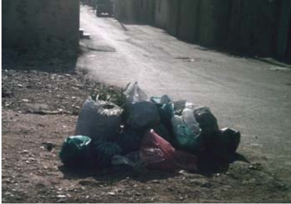
Fig. 3 Using plastic bags for transferring MSW in Khoram Abad