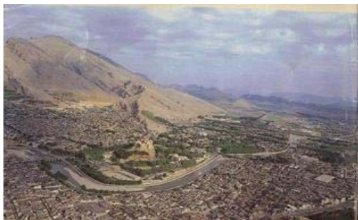
Fig. 2 A view of Khoram Abad city