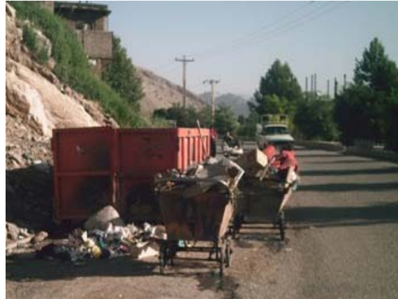
Fig. 5 Temporary terminal for collection solid waste

Local Authority (KhoramAbad Municipality) is responsible for waste collection, transportation and street sweeping. Municipality is responsible for waste collection, using private sector contracts.