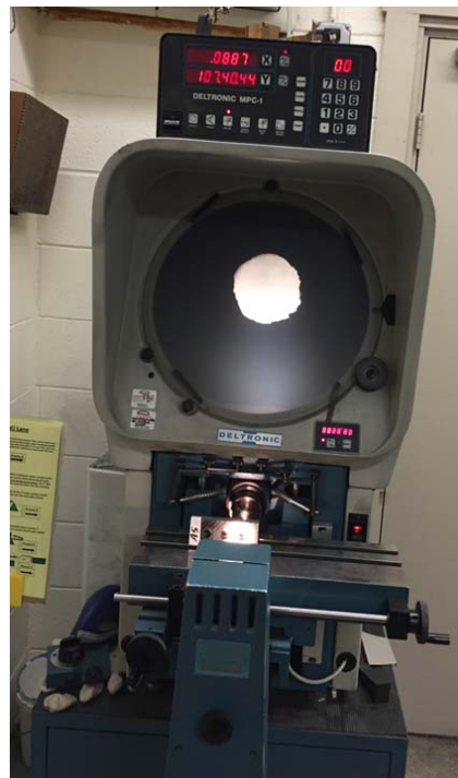
Fig. 1 The projection of a drilled hole as it appeared on the screen of the optical comparator

The process of determining the hole diameter involved selecting three points on the perimeter of the circle. The machine would then indicate the radius of the circle with that high precision.