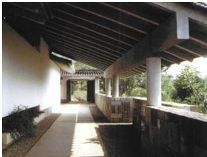
Fig. 5 The staggered roof at the entrance of the Xixi Scenery Spot Reception [3]