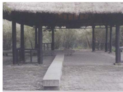
Fig. 14 The stone bench in the Bamboo Pavilion [10]

Square Pagoda Garden writes the "meaning" of the time with the spirit of nature, which guides the flow and transformation of space and provides an opportunity for the progression of the incident [1]. Nine arc walls of different heights, diameters, and