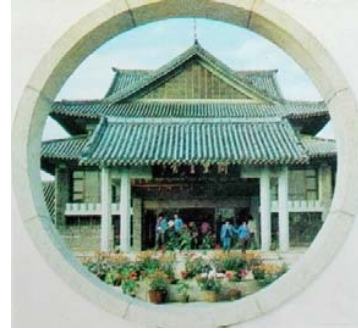
Fig. 1 The cross-ridge gable and hip roof with multiple eaves above the foyer of Queli Hotel