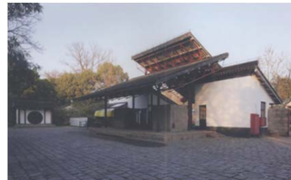
Fig. 6 The hip roof on the Square Pagoda Garden's north gate [10]