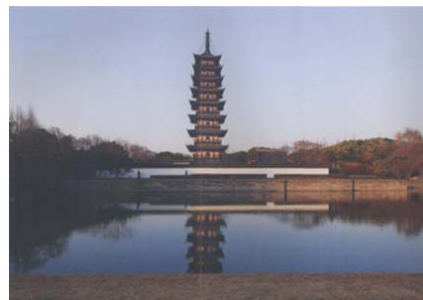
Fig. 13 The large white wall facing the water at the foot of the square tower [10]