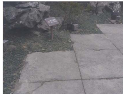
Fig. 12 The broken pavements in corners [10]