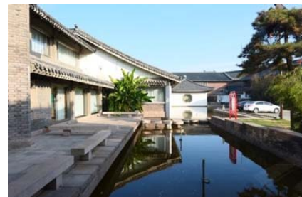
Fig. 9 The view to the east of the entrance of Queli Hotel

The layout of the public area of the Queli Hotel borrows the form of Chinese traditional garden, which reveals the resistance to symmetry and order. In the three core spaces of the foyer, dining room and meeting room, the four central columns at the ceiling level and the walls on the four sides constitute a centralized main space, divided into two groups which are connected on different axes with a transitional space in the middle, and they form into a cross-shaped plane centered on the foyer. Due to the complexity of the plane function, the functional volume that "overflow" outside the ideal space unit tends to present the form of "appendage" [8] in the formal composition (Fig. 10). The pool with gradient changes at the entrance, the winding path beside the pool, and the hall and dining hall across the water, are a group of spatial images from the Chinese traditional garden. They enlarged the "overflow" effect of the small space and transformed it into an elaborate arrangement, so that it could satisfy Dai Nianci's assumption of a fan-shaped viewing effect in the southeast corner of the Hotel from the perspective of the west exit of Wumaci Street. Simultaneously, it is also a way to break the homogeneity of