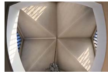
Fig. 2 Concrete folded-shell structure of Queli Hotel

The interpretation of meaning representation in form is more thoroughly reflected in the Xidan Market building in Beijing. The traditional roof (including the pillars) is abstracted, simplified and deformed, and reassembled as a form fragment or symbol placed in the middle of the facade to express the symbolism and metaphor of the “tradition”. This approach avoids the premise constraint of structural rationality, separates the structural and spatial foundation of the traditional roof, and obtains support under postmodernism context. In fact, in such a strong and metaphysical posture and narrative method, the roof breaks away from the artisan tradition and the spatial foundation of the traditional quadrangle courtyard. It is reduced to a pattern or form fragment abandoning the practical operation and social attributes, a puzzle that satisfies the vision and association.