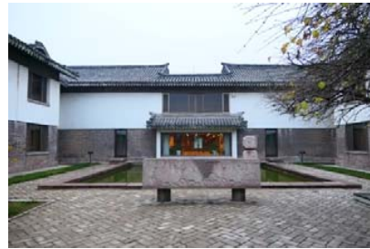
Fig. 8 The main courtyard in Guest room area of Queli Hotel

Even the positions of the plants in the courtyard have been carefully designed as part of the plane symmetry design. Although the Hotel takes the quadrangle courtyard as the prototype, it tends to adopt its shape in the passive response to its site and use, emphasizing the volume change of the building itself rather than the courtyard itself. There is a square green space surrounded by a circle of corridors in the courtyard, making it impossible to prepare for the narrative of time and events. In the self-sufficient and closed form, the sentiment and character of the traditional quadrangle courtyard have not been explored.