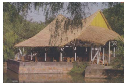
Fig. 7 The bamboo roofs of the Helou Pavilion [10]

Feng Jizhong's Square Pagoda Garden rejected the symbolism in form and the reproduction of the wooden structure, interpreting the tradition as an autonomous type of