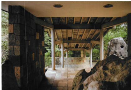
Fig. 4 The column-beam system of the roof and the multi-ribbed roof of the Xixi Scenery Spot Reception [3]