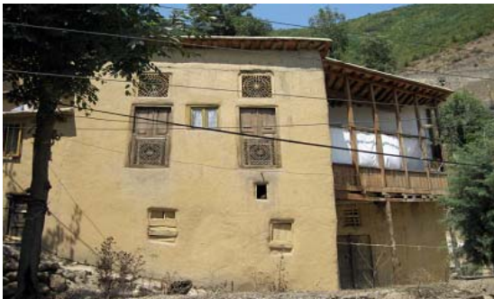
Fig. 7 The sample of Talar Ke house