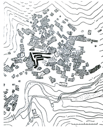
Fig. 5 The location of Bazar in Masouleh

With the expansion of Masouleh houses in south or south west, the dwellers enjoyed enough sunlight in winter and local airflow in summer.