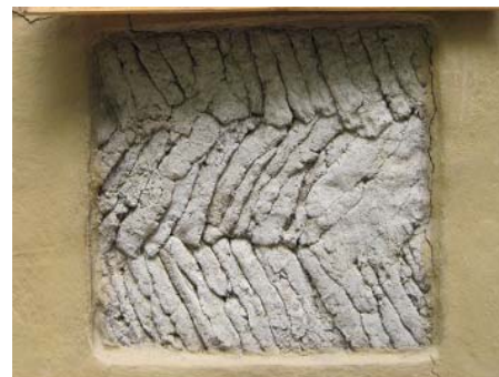
Fig. 10 Adobe and stones were provided walls

Horizontal beams (Oak wood) were installed on the cradles of the walls, also some other beams which called Kalile put in as parallel as the horizontal beams to make roof; Kalile was distribute the stress. As a next step, timbers (Beech wood) were connected to the beams in each 20 or 30 centimeters. Then the crevices among the timber of floor were covered with cob, wild fern and Fal-gel with 8%-10% slope; wild ferns grow abundantly in Masouleh and acting as an insulator