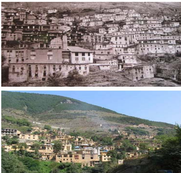
Fig. 15 Old Masouleh and new Masouleh

Historic village of Masouleh is the first Iranian city which has been completely registered in list of Iran's National Heritage sites. Despite all the problems, cultural heritage experts are making huge effort to prepare the suitable ground for its world registration.