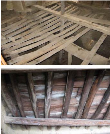
Fig. 11 The structure of roof at first until the end

against water. Also Fal- gel is a common plaster which is mixture of clay, shattered rice stalk and water; shattered rice stalk should not be longer than 10 centimeters (Fig. 11).