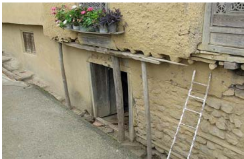
Fig. 8 Basement was made by stone

The existence of rainforest because of humid and mild climate, has led to utmost using of Local materials in vernacular architecture. Hence, wood, stones, wild ferns and adobe were used as the main sources of building in Masouleh. The foundation and basement were consist of thick lumbers and stones. The stones of foundation and basement were avoided the penetration of land moisture into the houses and absorb the warmth of sunlight during the day [8], [10], [17] (Fig.8).