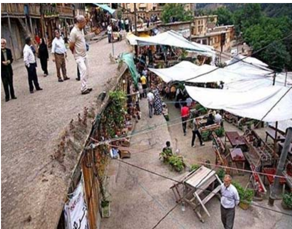
Fig. 4 The main financial part of Masouleh, Bazar

Bazar of Masouleh is seven- storey and there are 120 shops in there (Fig. 4).