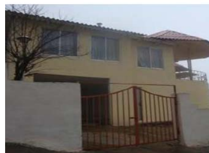
Fig. 14 New construction in staircase structure of Masouleh

On the other hand, Villagers' dwelling pattern is changing with time due to penetration of urban culture through mass media. Therefore, during last 60 years, Masouleh population