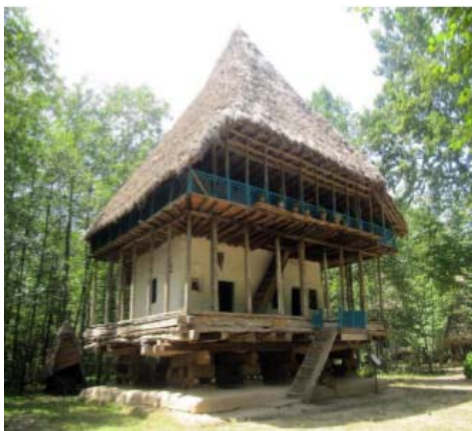
Fig. 1 The sample of height expansion houses in Gilan