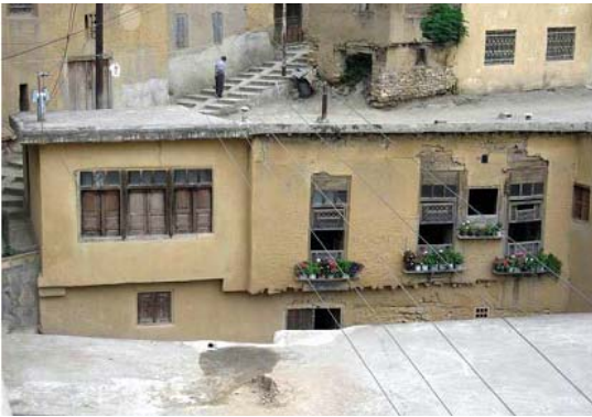
Fig. 6 The sample of Baria Ke house

Also The hall where located behind the rooms or Talar in local language is called Soumeh, which is also the family winter quarter [7].