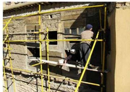
Fig. 9 Ingredients of wall in Masouleh houses