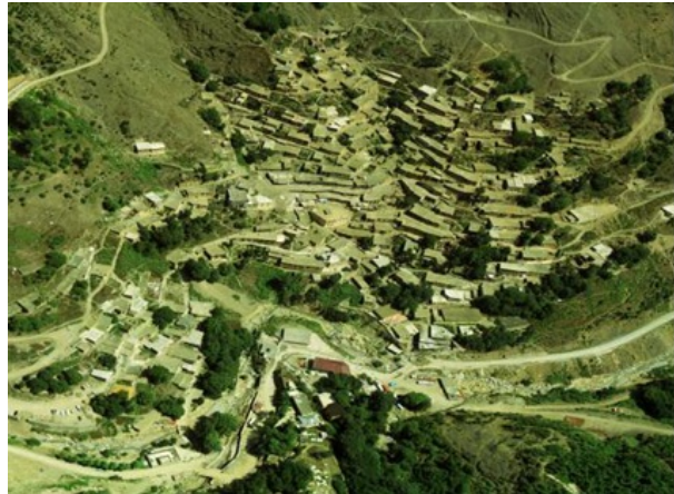
Fig. 2 Aerial photograph of Masouleh

Masouleh is a Beautiful village near the Alborz mountain range with peculiar architecture of its own. Spread over 100 hectares, Masouleh is located at the southern end of the humid Caspian Sea in a river valley. This city is 1050 meters above sea-level. Because of the beauty of nature and unique traditional architecture of Masouleh, the village was registered as a national monument in 1975 with the number of 1090 (Fig. 2) [14].