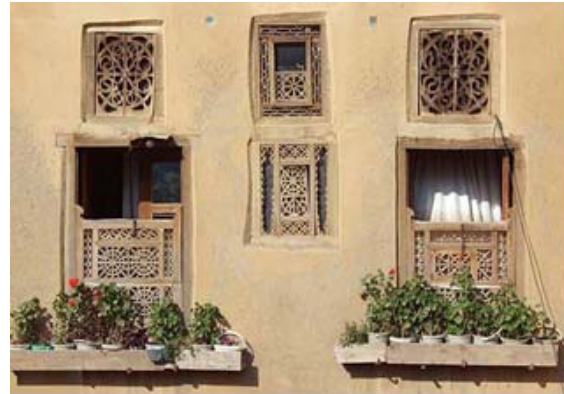
Fig. 13 The sample of Window in Masouleh houses

aesthetic role and craftsmen use the geometric and especially circle motif for establishment [18] (Fig. 13).