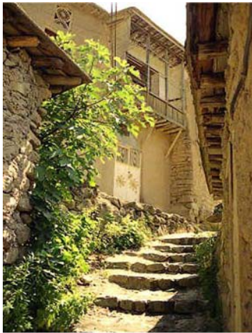
Fig. 3 Access routes and allays in Masouleh

also would not make it possible for vehicle to enter (Fig. 3).