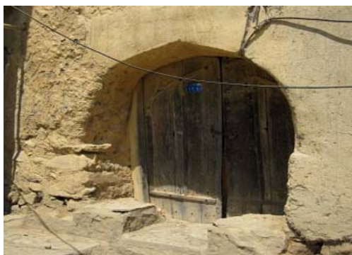
Fig. 12 The sample of door in Masouleh houses

Often tree trunks are used as elements not only for the structural use, but also for decorative components as doors and windows [10]. Doors in Masouleh houses are made in different way; the most common variety of doors in Masouleh are single-leaf doors and double-leaf doors. Standard door size in residential houses is 70 centimeter wide and 160-170 high, but the door of some houses has 170 width and 200 centimeter height for transportation of domestic animals (Fig. 12).