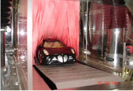
Fig. 3 Washing