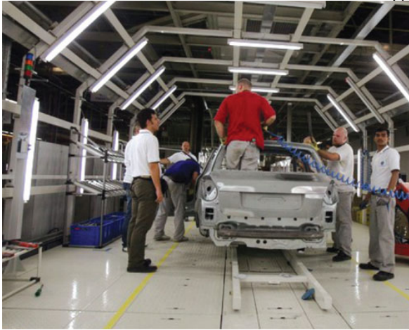
Fig 2 Shop Floor Management in action at Toyota