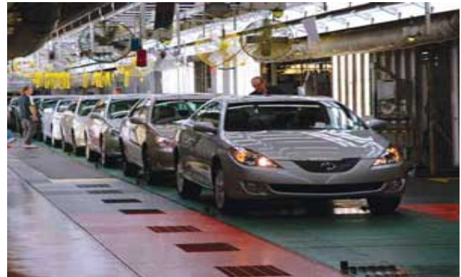
Fig 1 Showing a Lean Manufacturing Assembly Line at one of the Toyota plants

Authors are with Department of school of Engineering, University of Portsmouth Anglesea Road, Portsmouth PO1 3DJ, United Kingdom (email: Said.Azzam@port.ac.uk, Laura.Arias@myport.ac.uk, Shikun.Zhou@port.ac.uk)