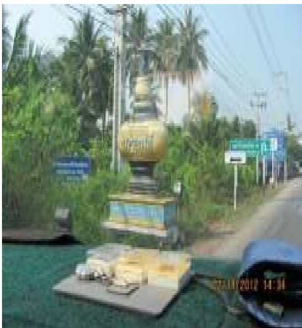
Fig. 2 Environment in Bang Khonthi