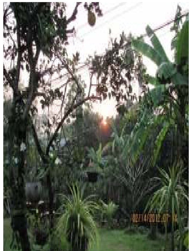
Fig. 4 Agriculture Area