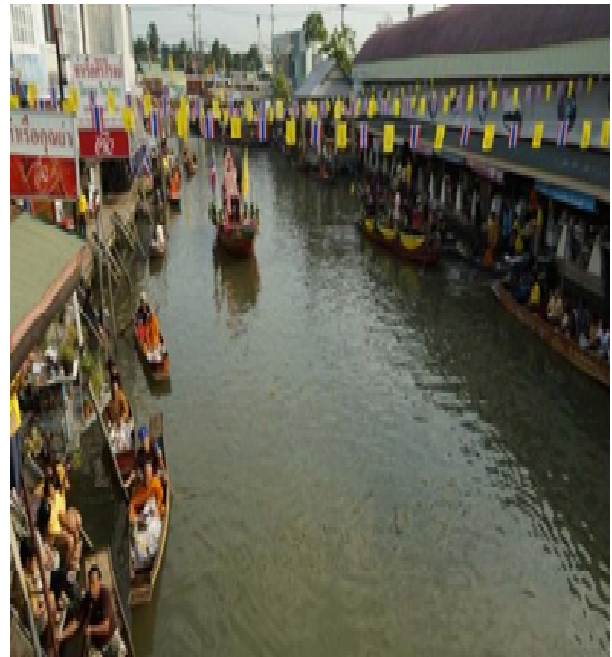
Fig. 3 Morning Culture Buddhist Style