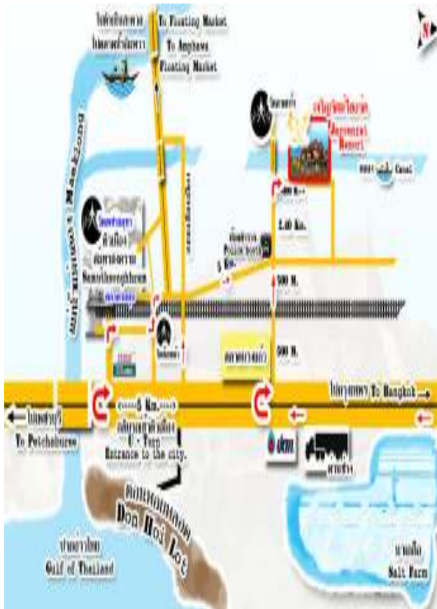
Fig. 1 Map of Samut Songkram