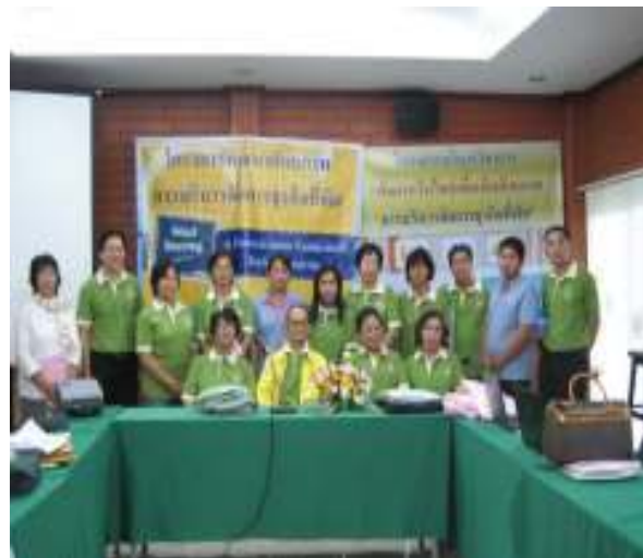
Fig. 7 Ruk Bang Khonti group

We have suggestions in two main aspects which are a policy and a suggestion for the entrepreneur of the residential in Samut Songkhram. A suggestion regarding the policy for Bang Khonthi district including a whole province of Samut Songkhram is that there must be a sponsor for an ecotourism which emphasizes on arts, culture, and the color of way of life. Also, the nature must be preserved by raising more awareness of tourists towards its importance to all lives on earth. The local people should be encouraged to form a network such as Ruk Bang Khonthi group which lets them share opinion and help one another. Eventually, this will lead to a learning process and an experience accumulation. In order to develop the tourism in this particular area, the policy should not be done hurriedly or comparing with others. The main goal is to let everybody involve and thoroughly have them experience the most out of this development. Hence, it can be said that living in accordance with the philosophy of sustainable economy is one approach leading to a real strong community as people are always reminded of a cautious life.