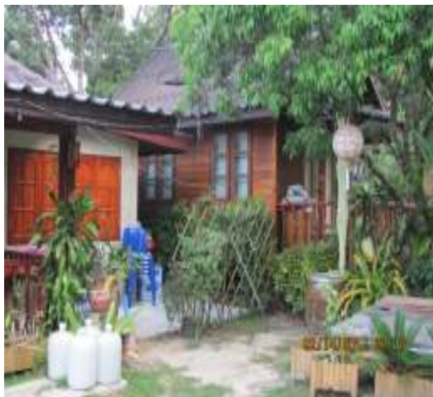
Fig. 5 Hospitality Business in Bang Khonthi