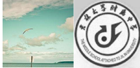
Fig. 1 (a) Original image (b) Watermark image

Xiaodi Wang is with the Math Department, Western Connecticut State University, CT 06810 USA (phone: 203-837-9355; e-mail: wangx@wcsu.edu).