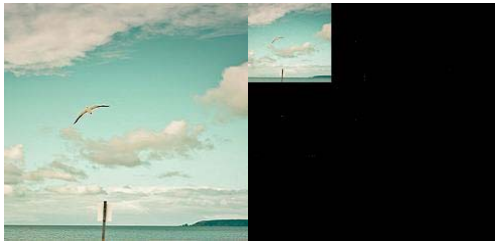
Fig. 2 (a) Original image (b) DMWT of the image

This wavelet matrix can be extended to any size of 3^n k \times 3^n k , where n, k \in \mathbb{N} .