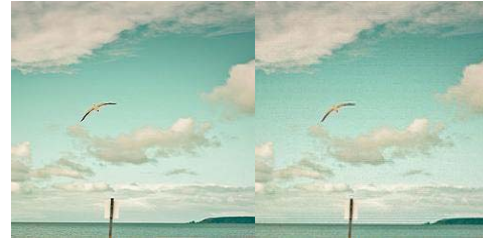
Fig. 4 (a) Original image (b) Watermarked image

expected. We thought the extracted watermark would be beyond recognition, but it didn't.