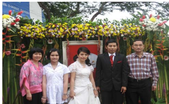
Fig. 9 Wedding ceremony

We have suggestions in two main aspects which are a policy and a suggestion for the entrepreneurs of the resort in Nakhon Pathom. A suggestion regarding the policy for the whole province is that there must be a support for an ecotourism which emphasizes arts, culture, and the beauty of the way of life. Also, the nature must be preserved by raising more awareness of tourists towards its importance to all life on earth. The local people should be encouraged to form a network which lets them share opinions and help one another. Eventually, this will lead to a learning process and an experience accumulation. In order to develop the tourism in this particular area, the policy should not be done hurriedly or by comparing with others. The main goal is to let everybody become involve and thoroughly have them experience the most out of the development. Hence, it can be said that living in accordance with the philosophy of sustainable economy is one approach leading to a real strong community as people are always reminded of a cautious life.