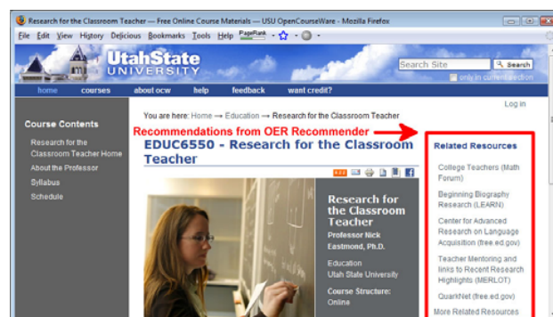
Fig. 2 An example of integrating OER Recommender into a web page

The simplest way to add Folksemantic OER recommendations to a web page is to place a small snippet of HTML in the web page. Additionally, recommendations can be retrieved in RSS, OAI, HTML, JSON, and XML formats. Figure 2 shows an example of a web page that has included the OER Recommender HTML snippet.