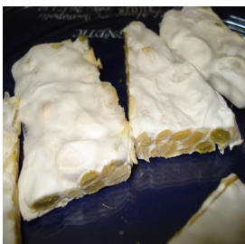
Fig. 3 Lateral side of soybean tempeh piece

Lateral side of tempeh piece (Figs. 3, 4) and a selection through the tempeh cakes revealed that, beans are tightly bound together and the spaces between them completely filled with mycelia. Good tempeh cake could easily cut into workable pieces, which are ready for consumption. Really good soy and kidney bean tempeh are different in some external features. Upper surface of good soy tempeh is covered with white mycelia and the lower surface with cotyledons white in color. In addition piece of soy tempeh keep its regular configuration by time.