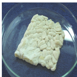
Fig. 2 Kidney bean tempeh

Lateral side of tempeh piece (Figs. 3, 4) and a selection through the tempeh cakes revealed that, beans are tightly bound together and the spaces between them completely filled with mycelia. Good tempeh cake could easily cut into workable pieces, which are ready for consumption. Really good soy and kidney bean tempeh are different in some external features. Upper surface of good soy tempeh is covered with white mycelia and the lower surface with cotyledons white in color. In addition piece of soy tempeh keep its regular configuration by time.