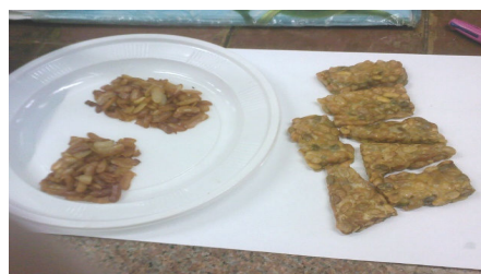
Fig. 6 Fried soy bean and kidney bean tempeh

Fried kidney and soy tempeh are shown in Fig. 6.