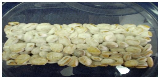
Fig. 5 Jojoba seeds tempeh

In conclusion fermentation of some legumes and jojoba seeds with 3.22 \times 10^5 spores suspension /100g seeds and incubation at 25-27°C for 18-24h resulting in good tempeh in the case of soy and kidney bean and acceptable tempeh for jojoba seeds.