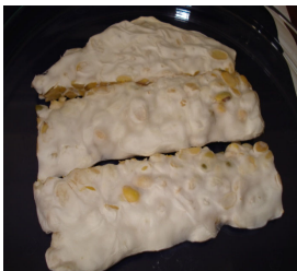
Fig. 1 Soybean tempeh