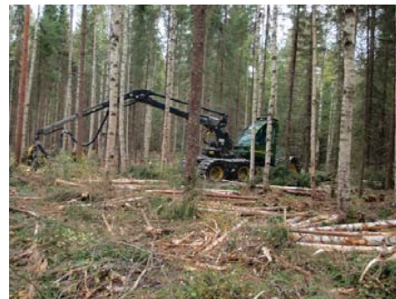
Fig. 1 Example of a forest machine

Not until recently have LED lamps reached a stage of development where they are efficient enough to be implemented in the lighting systems of forest machines (Fig. 1).