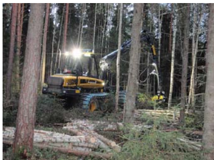
Fig. 4 Working environment in the evening