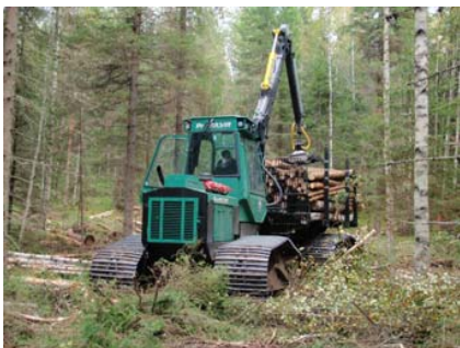
Fig. 3 Working environment of Finnish forest machine in the daytime

Fig. 3 shows the working environment of the Finnish forest machine in the daytime, and Fig. 4 shows the working environment in the evening.