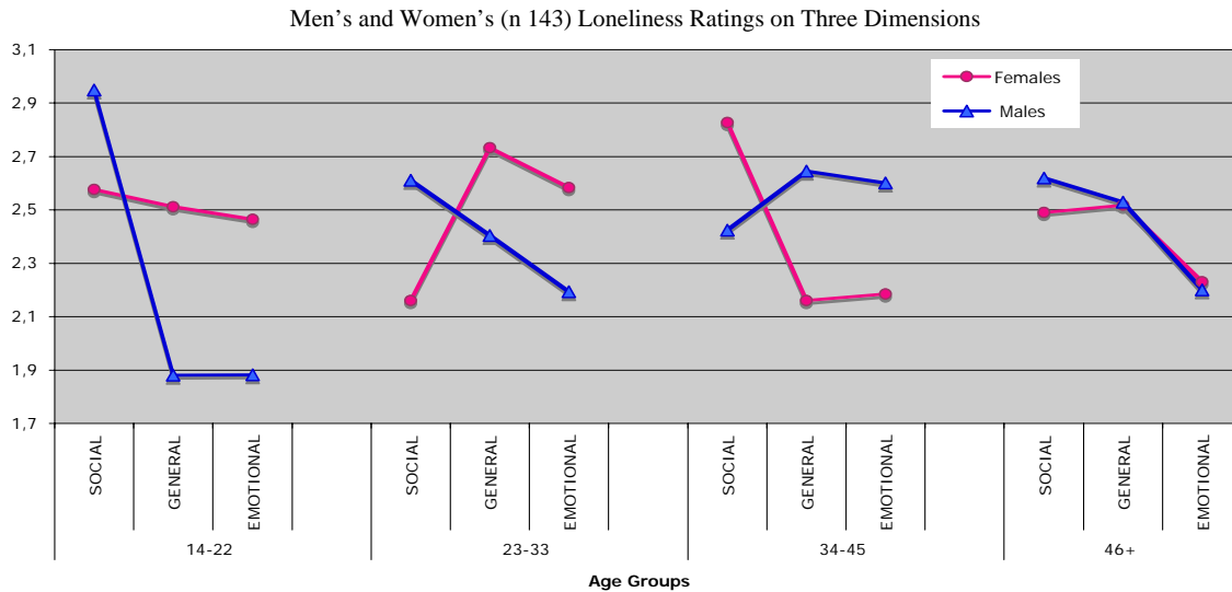
Fig. 1 Mean scores of 3 Loneliness Subscales in Italian respondents, readers of the magazine Focus (Study 2)