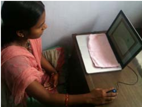
Fig. 7 A participant, a first time computer user trying out the apple pie user interface

The test involved 11 participants all female and ages ranging between 19 to 40 year and an average of 29 years. Only four of the eleven participants had ever used a computer before and that too sparingly and not within the last one year.