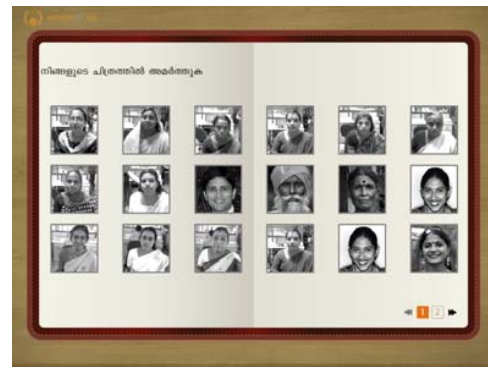
Fig. 2 The graphical login screen showing the pictures of the users used as their username in the VET application

Fig. 2. This creates an immediate and obvious issue with using an English language keyboard for low literacy users.