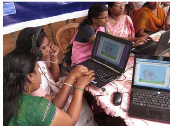
Fig. 1 Women taking a computerized VET course on fabric painting offered by Ammachi Labs in Kerala, India

for the first time. We have observed, as cited in previous studies [5], that if there is not clear guidance in the process of using the application, the user feels that they may “break something” and fail to return to their place in the application.