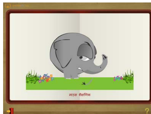
Fig. 3 Screenshot of the mouse tutorial game for teaching use of mouse clicks and drag drop

The mouse tutorial is a 2D animation that shows the relation between the mouse movement and the cursor on the screen, and highlights which fingers should click the left button and for what purpose.