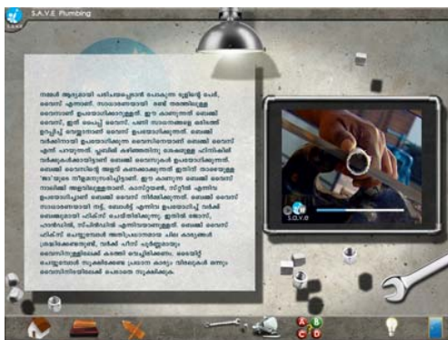
Fig. 6 Screenshot of the old UI video lecture screen showing the background graphics that created confusion for the users

c. Navigation buttons and Workable Area: There exists a general back button but there was reluctance to click it and users seem to struggle a lot before remembering that it was the way out.