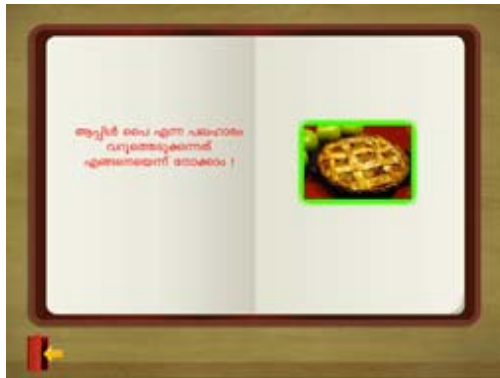
Fig. 8 Green glowing clickable button on the apple pie application suggests the next navigational step

All the participants had basic literacy skills having completed their 10 th grade education. It needs emphasis that the apple pie test application is designed such that it does not require the use of a keyboard at all. Hence we covered up the keyboard with a piece of cloth, as seen in Fig. 7, to create a more simplified and less intimidating experience for the novice users. A passive observer sitting behind the user took down observations. Pre-test and post-test surveys were also administered.