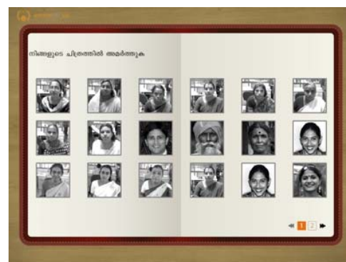
Fig. 2 The graphical login screen showing the pictures of the users used as their username in the VET application

Fig. 2. This creates an immediate and obvious issue with using an English language keyboard for low literacy users.