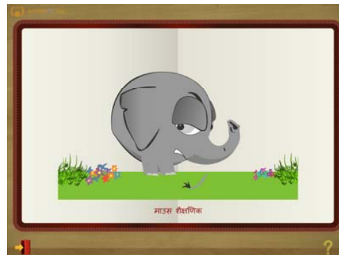
Fig. 3 Screenshot of the mouse tutorial game for teaching use of mouse clicks and drag drop

The mouse tutorial is a 2D animation that shows the relation between the mouse movement and the cursor on the screen, and highlights which fingers should click the left button and for what purpose.