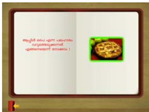
Fig. 8 Green glowing clickable button on the apple pie application suggests the next navigational step

All the participants had basic literacy skills having completed their 10 th grade education. It needs emphasis that the apple pie test application is designed such that it does not require the use of a keyboard at all. Hence we covered up the keyboard with a piece of cloth, as seen in Fig. 7, to create a more simplified and less intimidating experience for the novice users. A passive observer sitting behind the user took down observations. Pre-test and post-test surveys were also administered.