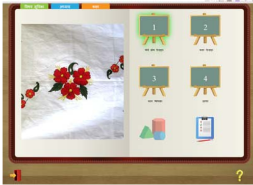
Fig. 4 Chapter selection page showing the skeuomorphic chalkboard and open book design

The main UI of the application was designed to look like an open book as shown in Fig. 4. We hypothesized that our target users would be familiar with a book and understand the hierarchies of using chapters and subchapters for navigating through the content.