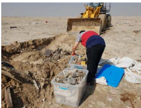
Fig. 2 The SW Reclamation Process at Disposal Site