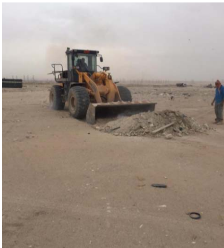
Fig. 1 Spade Tractor at the Site Reclaiming the Material