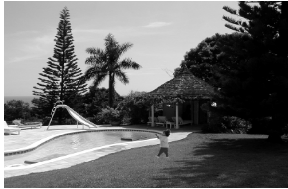
Fig. 2 Children detection

Simulation results that performed in Matlab simulink environment is presented in Figs. 2 and 3, figures represent base frame that is base of comparison consecutive frame that compared with base frame. In Addition edge detection block output in Fig. 3 is shown. Matrix in Fig. 4 shows final results [6].