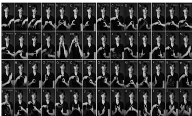
Fig. 2 Example of double-handed finger alphabet