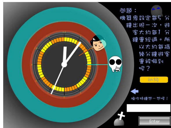
Fig. 3 The game of haunted house