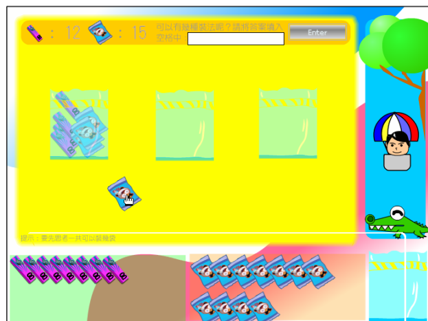
Fig. 4 The game of candy packing