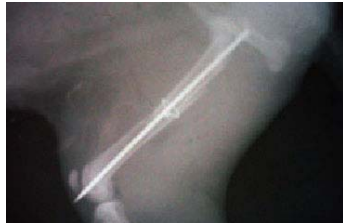
Fig. 14 Mediolateral radiographic image of 6-months old dog with complete femoral fracture treated with intramedullary pin and circlage wire

After 3-5 months complete remodeling occurred in operated cases. The fractured humerus, radius and ulna were illustrated in the same table. Femoral neck fractures in young cats were treated by femoral head resection.