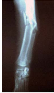
Fig. 6 Dorsoventral x- ray image of complete comminuted fracture of radius and ulna in a dog

The traumatic supra – condylar femoral fractures in dogs were repaired successfully using cross- pin technique (Fig. 9). Stack pins provided effective stabilization to complete oblique femoral fracture (Fig. 10), whereas use of Intramedullary pinning technique and circlage wire was effective in tibial fractures (Fig.11) and in humeral fractures (Fig.12).