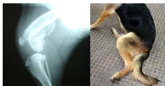
Fig.1 Mediolateral x-ray image of supracondylar metaphyseal femoral fracture in one-year old German shepherd dog

The young ages were the most commonly affected animals. In the present work, the ages of the fractured dogs were ranging between 4 months to 12 years old, whereas in cats from 4 weeks till 10 years old. Metaphyseal femoral and tibial fractures were common in puppies and kittens (4-18 months old). The body weights of the fractured dogs were ranging from 4 - 30 kg and that of cats from 1- 6 kg.