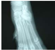
Fig. 7 Dorsopalmar x- ray image of complete oblique fracture of 5th metacarpal bone in a dog