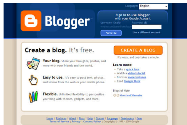
Fig. 4 Google Blogger (adopted from webhostingsecretrevealed.com)

One of Google's earliest ventures into social networking is the social networking and blogging site Blogger.com, acquired by the company in 2002. Blogger.com (Fig. 2) was one of the earliest social networking sites, having been established in 1999 as a small social network site. Blogger.com's corporate policies remain adherent to the ideals of openness and availability of content that is often expressed in Web 2.0 definitions. Limitations on content are restricted only to the legally required minimum, and copyrights are explicitly assigned to the writer in order to encourage content creation and sharing.