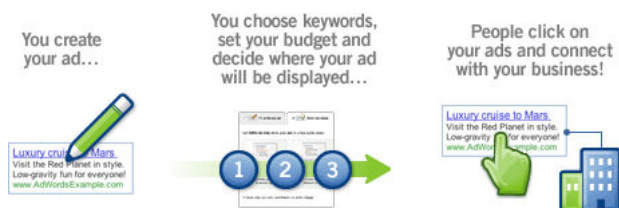
Fig. 2 AdWords (adopted from adwords.google.com.au)

No other EC company can match the success of Google and its meteoric rise. Google is considered by many to be not only changing the Internet but also the world. Google uses several varieties of search engine advertising methods that are generating billions of dollars in revenue and profits. The major methods are AdWords (Fig. 2) and AdSense (Fig. 3)