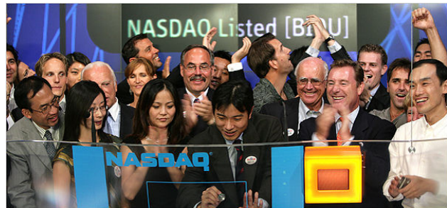
Fig. 5 IPO victory of Baidu (adopted from nytimes.com)

Financially, Baidu took the road from venture capital (VC) firms to initial public offering (IPO). In 2001, the company raised $1.2 million from VC firm financing, and another $10 million from four VC companies led by Draper Fisher Jurvetson and International Data Group. In 2004, Baidu acquired Hao123.com, a popular Chinese Web directory, then 25th at Alexa.com's global Internet traffic ranking. In March 2005, Baidu began its preparation to go public, and finally in August, it achieved IPO victory in the United States (see Fig. 5), opening at $66 and closing at $120 per share [2].