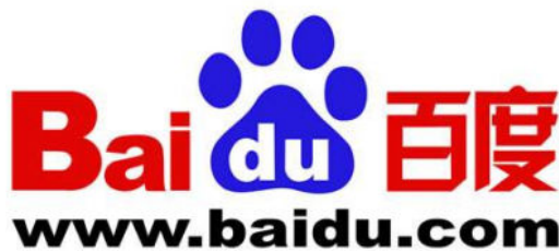
Fig. 4 Baidu

The SEO rules for the Chinese Internet market however are quite different than those discussed earlier due to various social, political and technological reasons. The following explains how the SEO and paid search work at Baidu (Fig. 5) the most popular search engine in China.