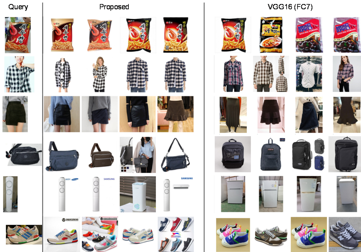
Fig. 3 Evaluating product recommendation performance from 2 million of online market database

classification and the cluster dataset consist of 34 classes of 17 categories and 3628 clusters, respectively.