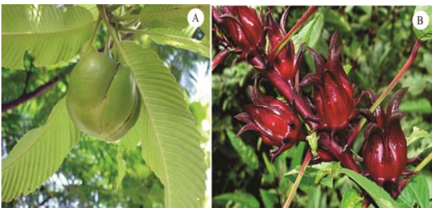
Fig. 3 (A) Matad ( Dillenia indica L.) (B) Kajaeb ( Hibiscus sabdariffa L.)

In addition, many studies indicated that several ingredient of traditional Mon foods, such as Kang Matad and Tom Yum, currently under scientific study for their incredible health benefits [15], [16]. Therefore, traditional Mon cuisine is one of the healthiest foods.