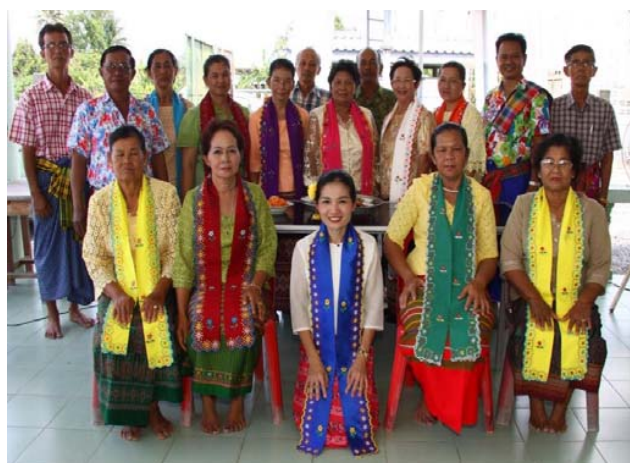
Fig. 1 The clothing of Mon women with author in the middle

One of the most efficient ways to get preliminary insights into the concept underlying traditional food is by means of