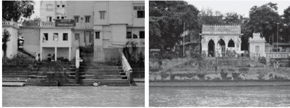
Fig. 5 Public spaces along the west bank, KMA