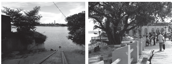
Fig. 6 Public spaces along the east bank, KMA