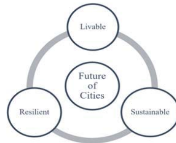
Fig. 1 'Future of cities' approach

physical and psychological needs and wants of its residents [8].