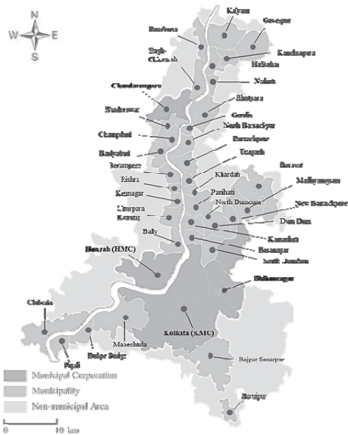
Fig. 3 Kolkata Metropolitan Area (KMA)

In Table III, the above-mentioned factors have been identified from a pool of factors, selected from extensive literature review. From ordinal logit regression [30], ‘T’ value for every selected factors have been calculated, and the ‘T’ value of those factors which have satisfied the value at 95% of confidence level (in this case it is 1.684) have considered as the most important factors to evaluate livability potential. At a conclusion, the above-mentioned factors (Table III) are the prime factors through which livability potential can be measured within a metropolitan scale.