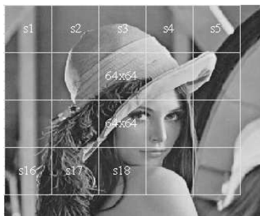
Figure 2. 18 segmented blocks of a CIF image.

To insert 18 orthogonal signals into host signals, we divide images into 18 blocks as shown in Fig. 2 whose size is 64 \times 64 pixels and a 1024 length orthogonal signal representing a 4 bits code from one segment is inserted into each block. PSNR of images after fingerprinting is over 43db and imperceptible to native eyes. A residual image between the original image and the fingerprinted image is shown in Fig. 3.