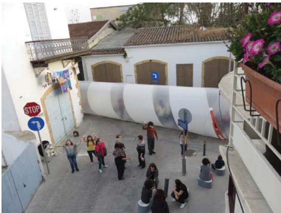
Fig. 5 Appropriation of the street during the ‘Pame Kaimakli’ [16] festival in 2015, organized by Y. Hadjichristou and Kaimakli neighbors

The ‘Green Urban Kitchen’ project by the NGO ‘Urban Gorillas’ utilizes an abandoned urban bus. Andre Wogensky suggested already back in 1952 the discussion of dwelling rather than habitat and the redefinition of dwelling as a set of everyday practices that are not limited to a single apartment but extend to commercial, health, educational, social and administrative services. [4] So the ‘Green Urban Kitchen’ project places it an underutilized public space and injects in it a natural milieu with lush vegetation. Furthermore, it adds to it the function of the kitchen allowing public and private kitchen and other activities to take place.