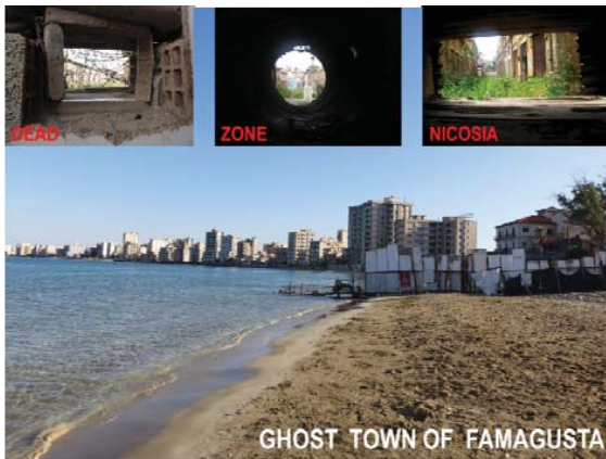
Fig. 1 Nicosia- the divided capital, Famagusta- the ghost city [12]

The time froze back in 1974: the most developed city in the island, embellished with luxurious sea front hotels and infrastructure was left abandoned. All the properties, private and public consists this no man's land territory. The whole city plays one main important role in the negotiations for solving the problem, in the area of properties. The literally dormant, decaying city tends to erase the borders of the properties. The nature, year by year takes over. It links the various properties into a unifying entity of which the connecting element is the thriving vegetation. Trees rise in the middle of the streets and pop out from the inner part of the buildings. The dilapidation and abandonment with the lush succulent, cacti and other untamed vegetation are interwoven in a contemporary unique 'war urban monument'.