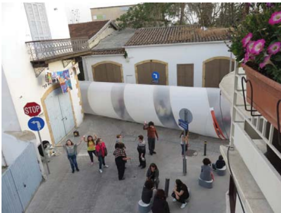
Fig. 5 Appropriation of the street during the ‘Pame Kaimakli’ [16] festival in 2015, organized by Y. Hadjichristou and Kaimakli neighbors

The ‘Green Urban Kitchen’ project by the NGO ‘Urban Gorillas’ utilizes an abandoned urban bus. Andre Wogensky suggested already back in 1952 the discussion of dwelling rather than habitat and the redefinition of dwelling as a set of everyday practices that are not limited to a single apartment but extend to commercial, health, educational, social and administrative services. [4] So the ‘Green Urban Kitchen’ project places it in an underutilized public space and injects in it a natural milieu with lush vegetation. Furthermore, it adds to it the function of the kitchen allowing public and private kitchen and other activities to take place.