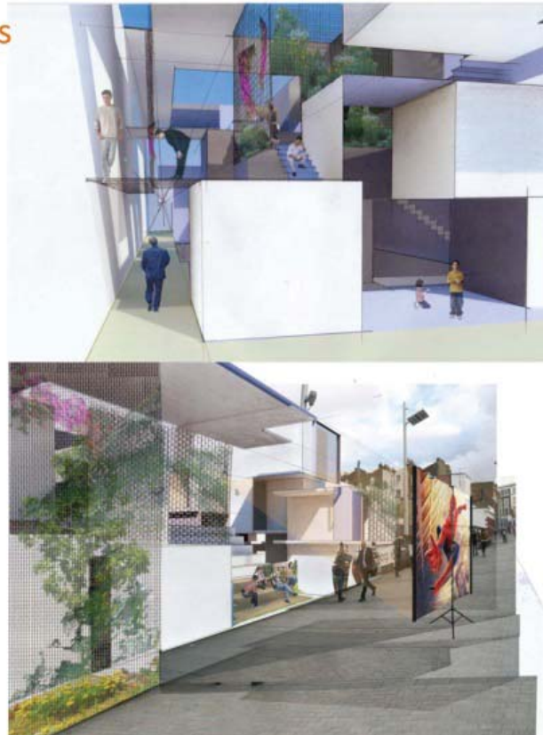
Fig. 3 Blurred boundaries. Investigations of the public/ private, Flow/ entrances [14]