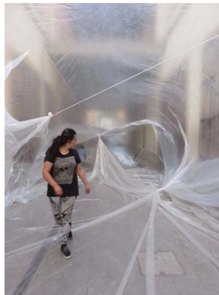
Fig. 6 Appropriation of the stoa by flexible and interactive inflatable structure [17]

The ‘Agoraphobic storm’_ ‘Nicosia traces’ at Stoa Tarsi (see Fig. 6) managed also to encourage the passerby to perceive in alternative ways the notion of this open but covered public space that was used primarily as a mere passage. Furthermore, the flexible and interactive character of the structure with the use of strings allowed the visitors to constantly alter the internal and external boundaries of the space, claiming as private parts of the external and internal public space.