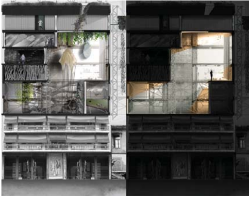
Fig. 4 Sculpting public spaces in the living domain [15]

inflatable structure, the ‘anthropometry’ live painting performance redefined its usage and significance of the dance and painting improvisation performance by artist Mathieu Devavry and the dancer Charlotte Kirschner was a witty interactive play with movements of the human body that prevailed in the space injecting the very private traces onto the ‘public canvas’.