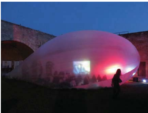
Fig. 7 Appropriation of the historical monuments [18]

By doing so, the defying of the existing urban rigid grids is proposed.