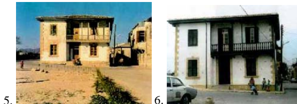
Fig. 5 Before Renovation; Fig. 6 After Renovation

Consequently, the Nicosia Master Plan team advocated a series of integrated priority projects to be initiated as the "Walled City Revitalization Policy." As part of this effort the first steps were taken – in the Selimiye Neighborhood improvement project, the Arabahmet Neighborhood improvement project and the Chrysaliniotissa Neighborhood improvement project – to put emphasis on housing stock rehabilitation, the upgrading community facilities and services, the induction of landscaping and traffic management (Figures 5 & 6 below).