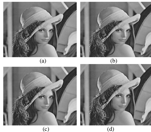
Fig. 2 The stego-images of "Lena" at the different pure payload. (a) 41.77 dB embedded with 0.5 bpp, (b) 37.92 dB embedded with 0.70 bpp, (c) 32.61 dB embedded with 1.0 bpp, and (d) 25.22 dB embedded with 1.50 bpp