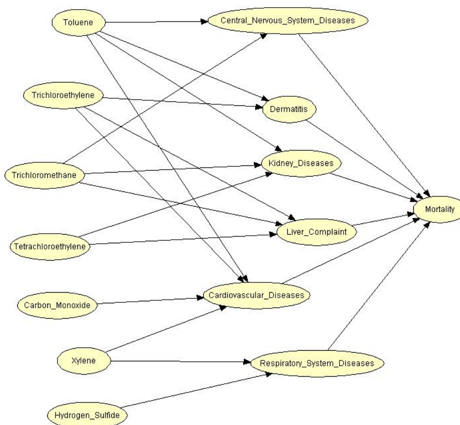
Fig. 2 BBN-HRA structure for hazardous substances in sanitary sewerage

between baseline and worst situations are calculated assigned on an interpolative basis.