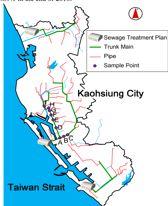
Fig. 1 Kaohsiung City sanitary sewerage and nine sample points [4]

Kaohsiung City is a coastal city with a population of about 150 million and becomes the transportation and commercial center in southern Taiwan. Besides, five industrial zones, two export processing zones, and other several important factories such as Taiwan Steel Corporation, Taiwan International Shipbuilding Corporation and Chinese Petroleum Corporation etc. turn Kaohsiung City into an industrial center as well. However, accompanying with the rapid development of Kaohsiung City, environmental pollution seriously affects the life quality of the residents. Before 1989, the domestic sewage and industrial wastewater directly or indirectly discharged into the river and threaten human and environmental health because the sewage connection rate in this city was only 6.5%. Therefore, at that time the Kaohsiung City Government launched the Kaohsiung City sewage system, which is shown in Fig. 1. The sewage connection rate in this city was upgraded to 60.89% in the end of 2010.