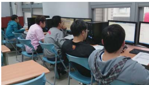
Fig. 2 The learning process