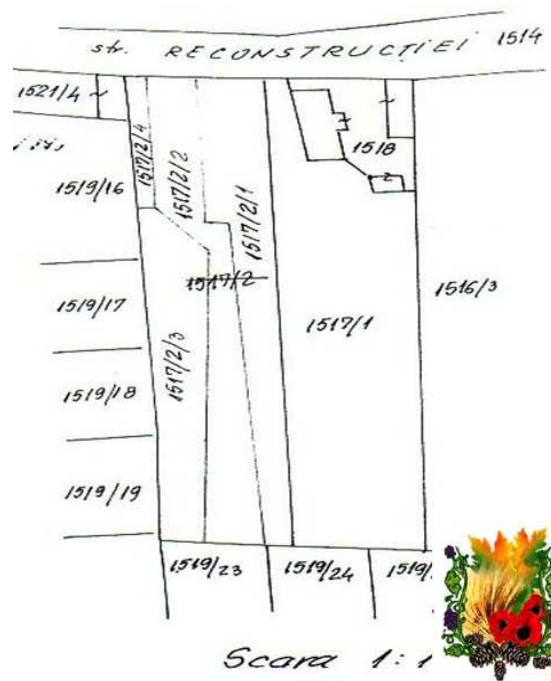
Fig. 1 Cadastral Document with graphical watermarking

The document with the transparent graphic watermark is presented below in the Fig. 2 Transparent watermark for the cadastral document.