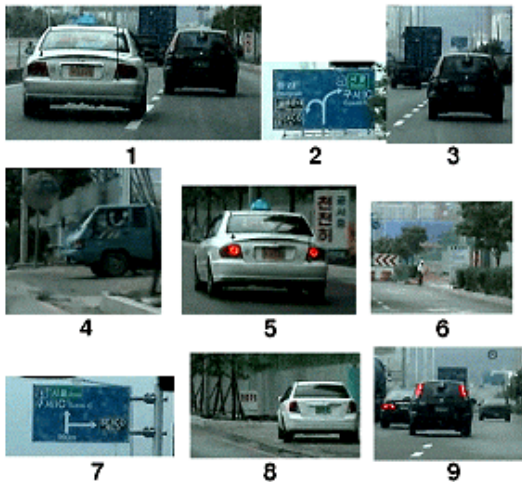
Fig. 2 Recognition task. Each captured image was comprised of real driving scenes. Total 9 small images were 3 foveal stimulus (appeared in center area), 3 peripheral stimulus (appeared in other lane or shoulder), and 3 road signs

Apparatus and stimulus. The driving scenes were recorded using a digital camcorder (SONY DCR-TRV40), and edited into four clips of 90 seconds long adopting the Windows Movie Maker(ver. 2.1). Each clip was edited to contain all the three types of stimuli mentioned above. The clips were projected on the screen(4×3m) located at 1.5m ahead of the driving simulator using a projector (EIKI, LC-7000U). This screen provided 50×40 degrees of visual angle. Examples of stimuli in the clips were shown in the Fig. 2.