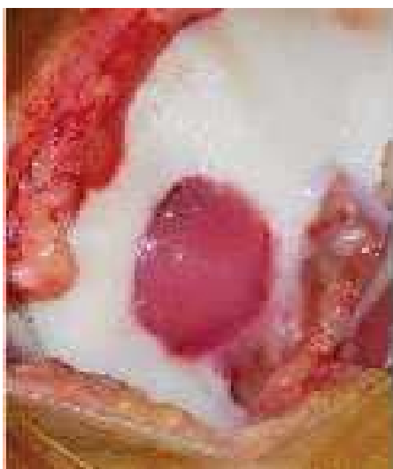
Fig. 1 Gel-based chondrocyte cells with fibrin implanted at involved site

Second stage surgery is performed with small arthrotomy, defect is visualized and debrided up to normal cartilage and edges are made sharp and undermined with knife to hold gel. Drill holes made with using 2mm drill bit, drilling done up to 2 mm depth. Holes made for graft anchoring purpose and bone wax is used to achieve hemostasis. After achieving homeostasis, saline wash was given to clean defect and surrounding area. Once defect is prepared defect brought in gravity dependent position and tested with 2ml saline for gravity dependency and volume requirement. Once defect is ready for implantation Regenerative Medical Services PVT LTD trained staff prepares cell-gel with mixing chondrocyte cells with fibrin it takes 5 to 7 minutes. After preparation, Duplojet syringe is provided loaded with fibrin, thrombin and chondrocyte.