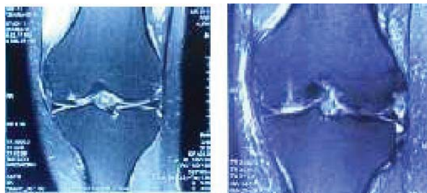
Fig. 2 Pre-operative and post-operative MRI antero-posterior views

summarized in terms of frequency count (n) and percentages (%) at Visit 7 and Visit 10 for all categories (Degree of defect repair and filling of the defect, integration to border zone, surface of the repair tissue, structure of the repair tissue, signal intensity of the repair tissue, subchondral lamina, subchondral bone, adhesion and effusion). Descriptive statistics (n, Mean, SD, Median and Range) were provided for IKDC subjective knee evaluation score at Visit 1, Visit 9 and Visit 10. Change in IKDC Subjective Knee Evaluation Score from Visit 1 to Visit 9 and from Visit 1 to Visit 10 was also summarized [6], [7], [17].