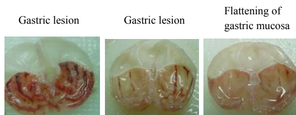
Fig.1 Gross appearance of the gastric mucosa in a rat “(a)” pre-treated with 5 ml/kg of CMC (ulcer control). Severe injuries are seen in the gastric mucosa. “(b)” Pre-treated with 5 ml/kg of omeprazole (20 mg/kg). Injuries to the gastric mucosa are milder compared to the injuries seen in the ulcer control rat. “(c)” pre-treated with 5 ml/kg of Swietenia mahagoni seed extract (400 mg/kg). Very mild injuries to the gastric mucosa are seen, and showed flattening of gastric mucosa.

All values are expressed as mean ± standard error mean. Means with different superscripts are significantly different. The mean difference is significant at the 0.05 level.