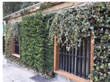
Fig. 5 Residential building, Tehran