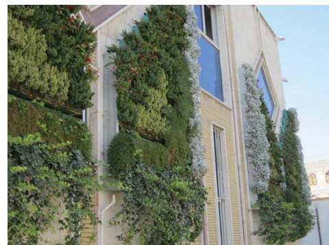
Fig. 4 Health paradise, Tehran