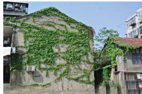
Fig. 3 Residential building with Ivy, Tehran

This matter manifests the great attention and respect of ancient Iranians for greening their lives. The exterior appearance of buildings in Iran was covered by climbers such as Ivy ( Hedera Helix ) and Grape ivy ( Ampelopsis ) form the old days. As Fig. 3 shows, seemingly they used the plants in that way just for decorating their buildings and not for their ecological or environmental effects [13].