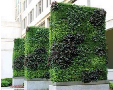
Fig. 1 Free Standing Green Wall

elements of the urban environment, the appearance of buildings and apartments can be mentioned which could be built creating in favor of sustainable [14] or biophilic [15] development. Combining traditional architecture and modern materials and technology has led to form present green facades and also to improve sustainable building functions [16]. Today, many different expressions are used to debating vegetated vertical building surfaces. For instance, free standing walls which called wall vegetation are used in Germany and made of brick and stone constrictions, are appropriate places for plant colonies to live in cracks, see Fig. 1 [17].