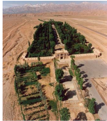
Fig. 2 Shazde Mahan Garden, Kerman, Iran

place representing Eden on the earth [31]. Ancient Persian gardens all transferred a mystical feeling for flavors and a great passion of garden. Supreme values and ideas are perfectly made evident and meaning, see Fig. 2 [32].