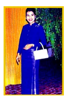
Fig. 9 Queen Sirikit in Thai Chit Lada dress

Thai Chit Lada costume with round neck blouse and collar contained with five buttonholes cut and long sleeves to the wrist match with fabric strip in the frontage.