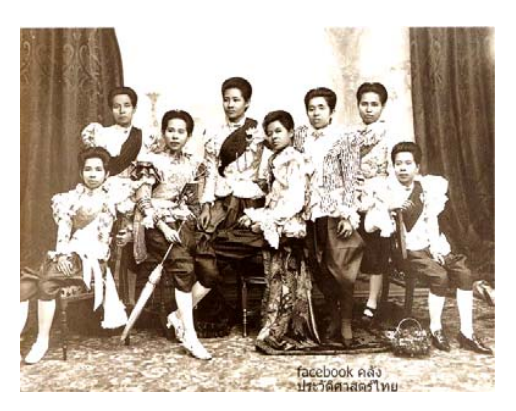
Fig. 4 The costumes Her Majesty the Queen and princess the reign of King Rama IV