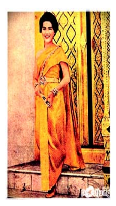
Fig. 17 Queen Sirikit in Thai Chakkri dress