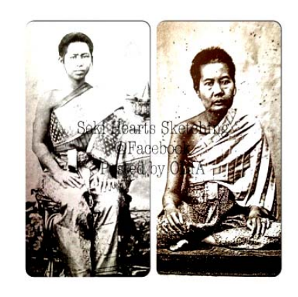
Fig. 1 Women costume in the reign of King Rama I-II

THAI traditional costumes has continually changed over 200 years of Rattanakosin era (1782 to present). During the Rattanakosin era, Thai costumes can be classified into 5 subcategories: Early Rattanakosin period, Mid-Rattanakosin period, Western Colonialism period, Cultural Mandates period and the modern period. Thai traditional clothing of each period varies by the environment, so it is impossible to judge which style is the best [1].