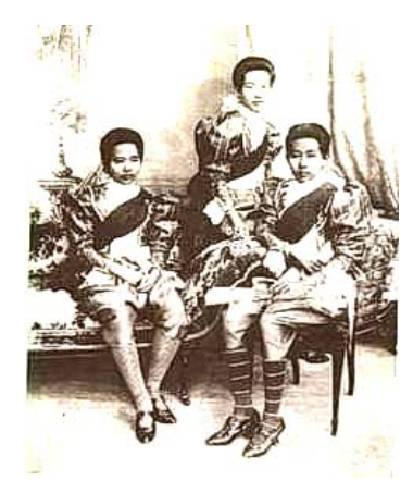
Fig. 5 The costumes Her Majesty the Queen and Princess the reign of King Rama IV

For Thai costume in the reign of King Rama IX (1946 to present), universal design is preferred due to influences from the western. However, people in local areas or countryside remain wearing Thai costume and local costume, i.e., wearing sarong, strip or loincloth. In 1977, Her Majesty Queen Sirikit was established a handicraft project to support products made by local woven fabric of villagers in various regions; therefore, this type of product was more recognized. However, it still preferred by people in high level society. Consequently, Her Majesty Queen Sirikit found the ways to create this product preferred extensively by general people; therefore, the royal initial was established to order skillful craftsmen of Fine Arts Department in many university to design Thai costume for Thai men by applying historical costume to be more contemporary and suit with current weather, environment, and convenience upon each occasion and place. Currently, the important evolution of Thai costume is formal Thai national costume, i.e., formal Thai national costume for women and Thai traditional costume for men, and it is accepted as Thai national costume [2].