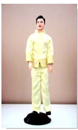
Fig. 24 Formal Thai national costume for men: short sleeve shirts and long sleeve shirts