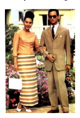
Fig. 7 Queen Sirikit in Thai Ruenton dress

1) Thai Ruean Ton costume with round scooped neckline blouse contained with five buttonholes cut and 3/4 sleeves match with fabric strip in the frontage.