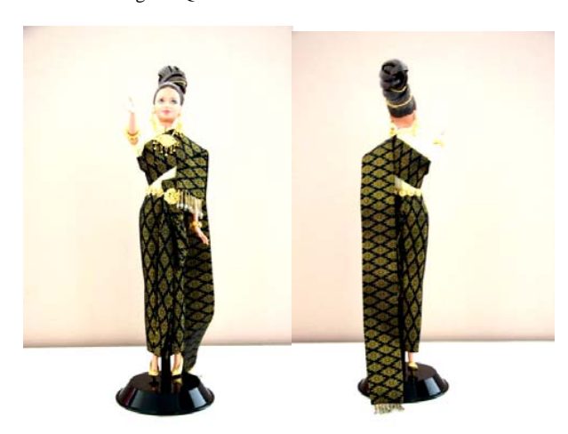
Fig. 16 Thai Siwalai dress (front and back).

3) Thai Chakri costume with off-shoulder blouse covered with breast cloth match with thin fabric gathered in folds and two ends of it fabric were twisted together and tucked up in the front.