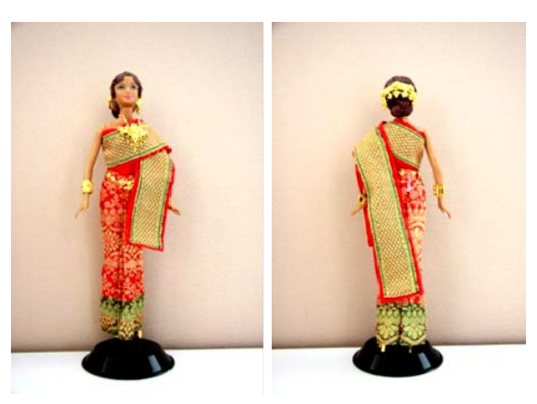
Fig. 20 Thai Chakkraphat dress (front and back)

5) Thai Dusit costume with sleeveless, backless and wide neck blouse with zip at the back and decorated with pearl or sequin match with thin fabric gathered in folds and two ends of it fabric were twisted together and tucked up in the front.