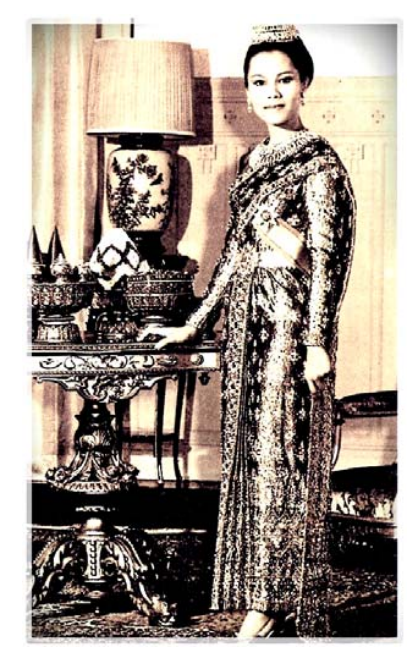
Fig. 15 Queen Sirikit in Thai Siwalai dress

2) Thai Siwalai costume had similar design with Thai Boromphiman costume but contained with breast cloth without silk fabric gathered in folds match withthin fabric gathered in folds and two ends of it fabric were twisted together and tucked up in the front.