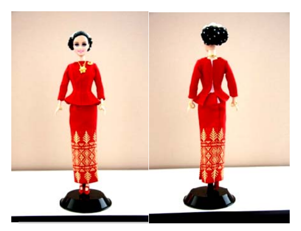
Fig. 8 Thai Ruenton dress (front and back)

Thai Chit Lada costume with round neck blouse and collar contained with five buttonholes cut and long sleeves to the wrist match with fabric strip in the frontage.