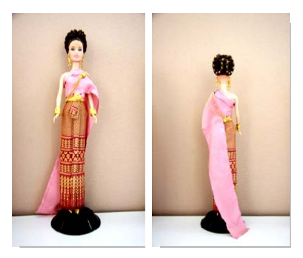
Fig. 18 Thai chakkri dress (front and back)

4) Thai Chakkraphat costume consisted of 2 designs: one was similar to Thai Chakri costume and Thai Siwalai costume but covered with 2 layers of breast cloth, i.e., the first layer was silk fabric gathered in folds and covered with Krong Thong breast cloth or embroidered breast cloth with one of its end was left at the waist level and another one was surrounded under wearer's right arm for leaving its end at the back side match with thin fabric gathered in folds and two ends of it fabric were twisted together and tucked up in the front.