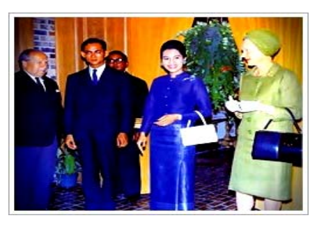
Fig. 6 The visiting of the King and Queen at Europe and America in 1960's

For Thai costume in the reign of King Rama IX (1946 to present), universal design is preferred due to influences from the western. However, people in local areas or countryside remain wearing Thai costume and local costume, i.e., wearing sarong, strip or loincloth. In 1977, Her Majesty Queen Sirikit was established a handicraft project to support products made by local woven fabric of villagers in various regions; therefore, this type of product was more recognized. However, it still preferred by people in high level society. Consequently, Her Majesty Queen Sirikit found the ways to create this product preferred extensively by general people; therefore, the royal initial was established to order skillful craftsmen of Fine Arts Department in many university to design Thai costume for Thai men by applying historical costume to be more contemporary and suit with current weather, environment, and convenience upon each occasion and place. Currently, the important evolution of Thai costume is formal Thai national costume, i.e., formal Thai national costume for women and Thai traditional costume for men, and it is accepted as Thai national costume [2].