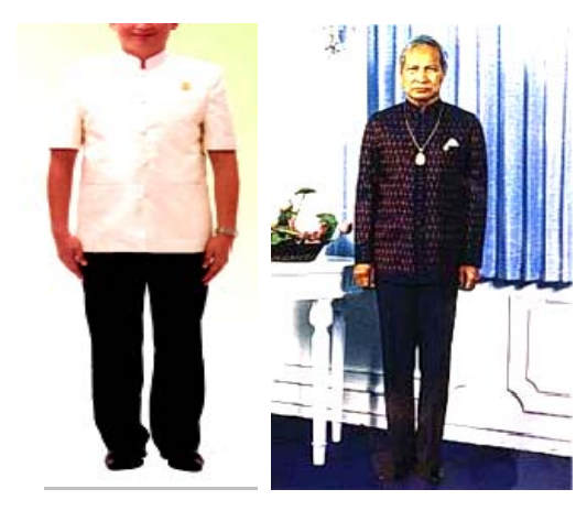
Fig. 23 Formal Thai national costume for men: short-sleeve shirt, long-sleeve shirt

Third design: Shirt with long-sleeves and waist wrapping called "Thai traditional costume" [6].