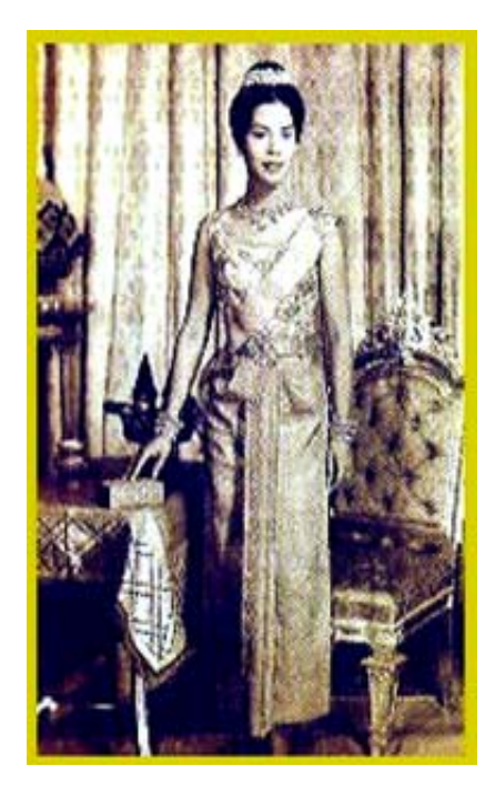
Fig. 21 Queen Sirikit in Thai Dusit dress