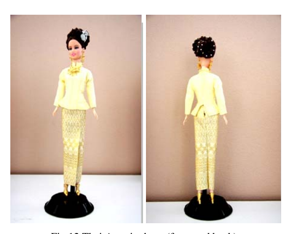
Fig.12 Thai Amarin dress (front and back).