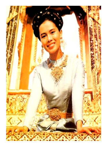
Fig. 13 Queen Sirikit in Thai Boromphiman dress

Thai Boromphiman costume with round neck blouse and collar contained with zip behind its long sleeves to the wrist match with thin fabric gathered in folds and two ends of it fabric were twisted together and tucked up in the front.