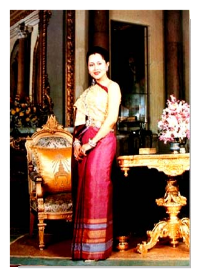
Fig. 19 Queen Sirikit in Thai Chakkraphat dress

4) Thai Chakkraphat costume consisted of 2 designs: one was similar to Thai Chakri costume and Thai Siwalai costume but covered with 2 layers of breast cloth, i.e., the first layer was silk fabric gathered in folds and covered with Krong Thong breast cloth or embroidered breast cloth with one of its end was left at the waist level and another one was surrounded under wearer's right arm for leaving its end at the back side match with thin fabric gathered in folds and two ends of it fabric were twisted together and tucked up in the front.