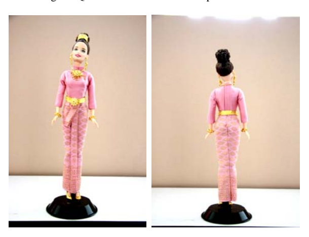
Fig. 14 Thai Boromphiman dress (front and back)

2) Thai Siwalai costume had similar design with Thai Boromphiman costume but contained with breast cloth without silk fabric gathered in folds match withthin fabric gathered in folds and two ends of it fabric were twisted together and tucked up in the front.