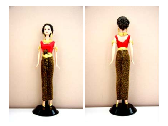
Fig. 22 Thai Dusit dress (front and back)

Formal Thai national costumes for women have been existed since the reign of King Rama IX and they were preferred to be worn in various well-known ceremonies as shown in above history. For Thai traditional costume for men, suits were previously preferred until 1977. In 1977, Her Majesty Queen Sirikit established handicraft project to support products made by local woven fabric of villagers in various regions therefore this type of product was more recognized. However, it was still preferred by people in high class society. [4] Consequently, Her Majesty Queen Sirikit found the ways to make this type of product preferred extensively by general people therefore the royal initial was established to order skillful craftsmen of Fine Arts Department to design Thai costume for Thai men by applying historical costume to be more contemporary and suit with current weather, environment, and convenience upon each occasion and place. As a result, the obtained design was