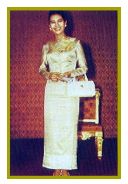
Fig. 11 Queen Sirikit in Thai Amarin dress

Thai Amarin costume had similar appearance with Thai Chitralada costume but it was made from Learn silk and brocaded with gold lace match with fabric strip in the frontage.