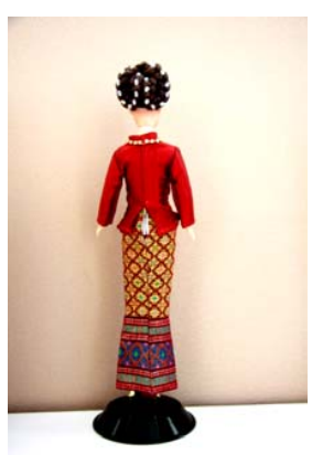
Fig. 10 Thai Chit Lada dress (front and back).

Thai Amarin costume had similar appearance with Thai Chitralada costume but it was made from Learn silk and brocaded with gold lace match with fabric strip in the frontage.