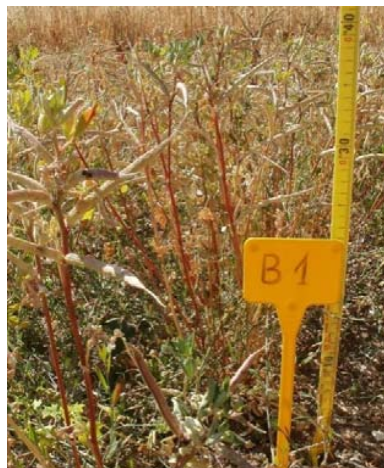
Fig. 3 (b) Plants of fenugreek before harvest sowed at the beginning of April on experimental field of "LARSAB" (France)