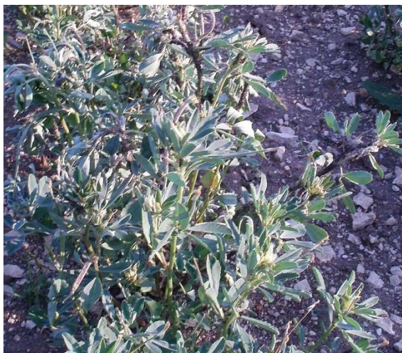
Fig. 4 Plants of fenugreek affected by aphid sowed at the middle of March on experimental field of "LARSAB" (France)