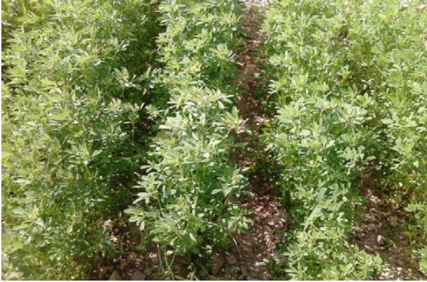
Fig. 2 Plants of fenugreek on experimental field of "Tushkovo" (Belarus)