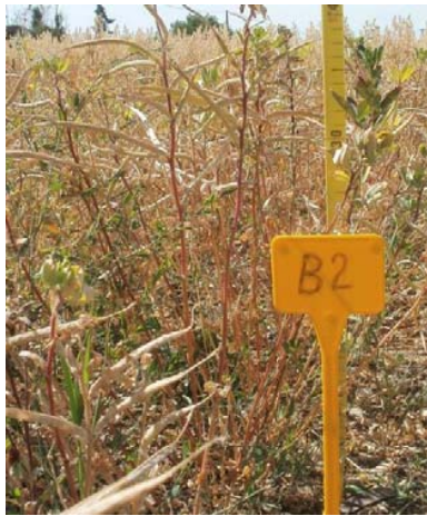
Fig. 3 (a) Plants of fenugreek before harvest sowed at the middle of March on experimental field of "LARSAB" (France)