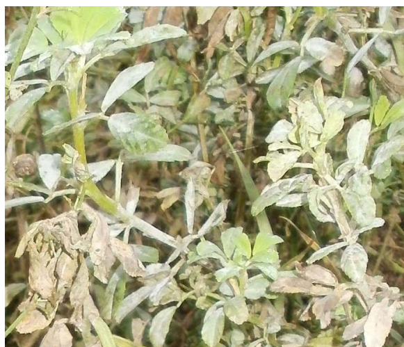
Fig. 5 Plants of fenugreek affected by powdery mildew on experimental field of "LARSAB" (France)