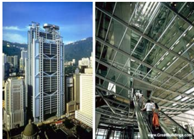
Fig. 8 Shanghai Bank

When International Finance Center was opened in 2003, it was the highest building of Hong Kong and the 4th of the world. The building, designed by the world famous architect Casa Pelli, has been constructed with accurate proportion on a square plan which is the best form for a building according to FengShui. It has 88 floors since the number 8 is considered lucky by the people of Hong Kong [23].