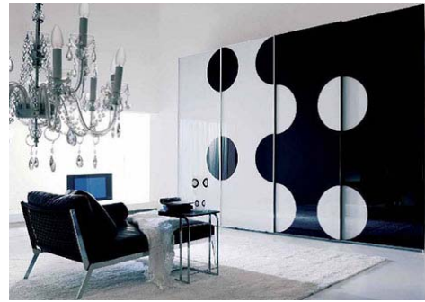
Fig. 3 Yin-Yang balance of black and white

Yin and Yang are not in conflict but rather elements that complement each other. When one of those is dominant, balance is dissolved and the other's power loses its impact. Yin and Yang always tend to balance each other in nature [17]. For example, a very smooth land should be balanced with rocks, sculptures, and a pagoda with layered roofs. Pagodas are FengShui solutions developed for very Yin lands (Fig. 4), [18].