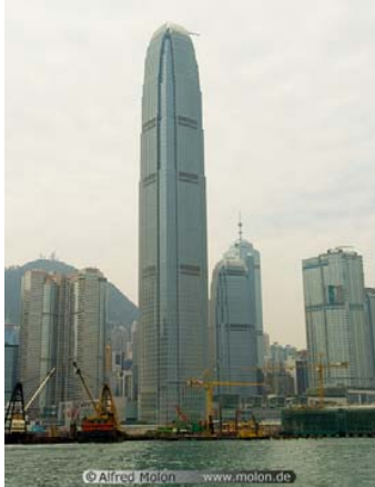
Fig. 9 International Finance Center