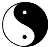
Fig. 2 Taoist symbol

FengShui advocates living in harmony with the environment and the energy emanating from the nature. For this reason, there is a harmonious balance between the forces of nature. Energy has two main sources in FengShui philosophy; Yin Chi and Yang Chi that has opposite characteristics. Yin and Yang are correlated [15]; such as there would be no light without dark, or no hot without cold. These are oppositions that complement each other and form all states of life and matter together. These move together in the order of creating positive and negative energies. Yin-Yang is the Taoist symbol of the universe (Figs. 2, 3), [16].