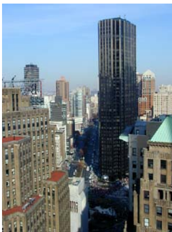
Fig. 10 Trump International Tower

In the west, the building constructed by FengShui principles by the famous businessman Donald Trump in New York is the Trump International Tower. In consideration of the success of the hotel and the tower, Trump stated that FengShui has created a balance felt by all inhabitants and guests with the comfort and peace brought into the rooms.