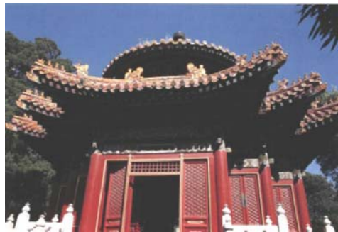
Fig. 4 Layered roof pagoda [18]