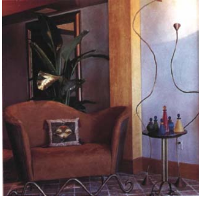
Fig. 5 A space where the balance of five elements is used [19] 2