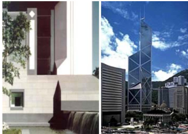
Fig. 7 Bank of China [20]

protect from the negative impacts of those. The rivals of Bank of China took these seriously. The most famous among them, Hong Kong & Shanghai Bank took defense position with the two guns on its roof. Norman Foster, the architect of the Hong Kong & Shanghai Bank building that is the most expensive building of the world, consulted a FengShui expert at all stages of design. While the arrows on the front surface of this building were placed downwards in the first place, they were then changed to upwards with the touch of FengShui. Upwards triangles represent the financial success of the company. Besides, interior escalators to upstairs are designed in the middle to have more money coming into the bank whereas the escalators to downstairs are hidden so that money would not leave the workplace [22].