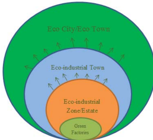
Fig. 1 The relationship between Eco-Town and Eco-Industrial Town

The concept of Eco-Industrial development has been applied to nine industrial parks in Thailand since 2009. The Eco-Industrial development reports show the uses of five development dimensions including 20 factors. The five development dimensions are physical, economic, environmental, social, and management dimensions. Detailed factors are shown in Fig. 2.