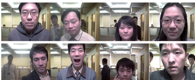
Fig. 3 Some face images of the testing domestic face database

The testing domestic face database consists of 837 images of 75 persons with no restriction on illumination, pose, and facial expression. 53 of 75 persons overlap with the persons of the training face database, and the other 22 persons are totally new. Each image is JPEG with a resolution of 640 \times 480 . Some face images of the testing domestic face database are shown in Fig. 3.