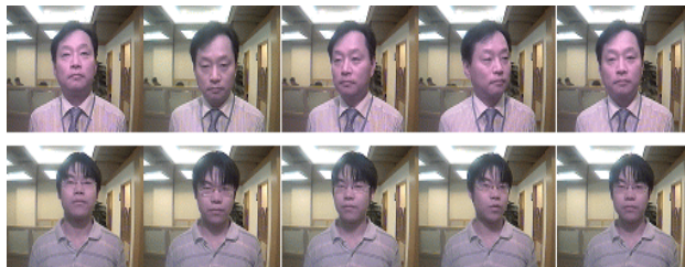
Fig. 2 Some face images of the training domestic face database

The training domestic face database consists of 415 images of 83 persons with 5 pose directions ( -45^\circ , -22.5^\circ , 0^\circ , +22.5^\circ , +45^\circ ) under different illuminations. Each image is JPEG with a resolution of 640 \times 480 . Some face images of the training domestic face database are shown in Fig. 2.