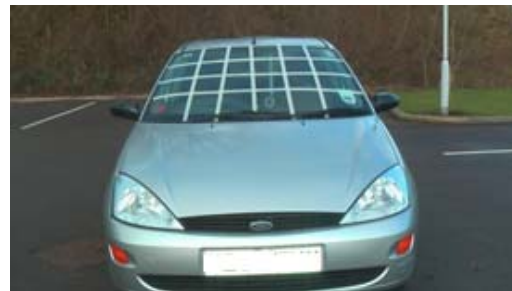
Fig. 3 Marking out 24 windscreen cells

The windscreen of a Ford Focus car was divided up into 24 cells consisting of 4 rows of 6 columns. Figure 3 shows an image of the car with the windscreen cells marked out with masking tape.