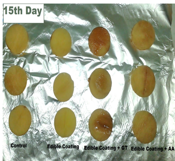
Fig. 3 Samples of potato slices after fifteen days of storage in 4°C: a) control b) edible coating c) edible coating + GT d) edible coating + AA