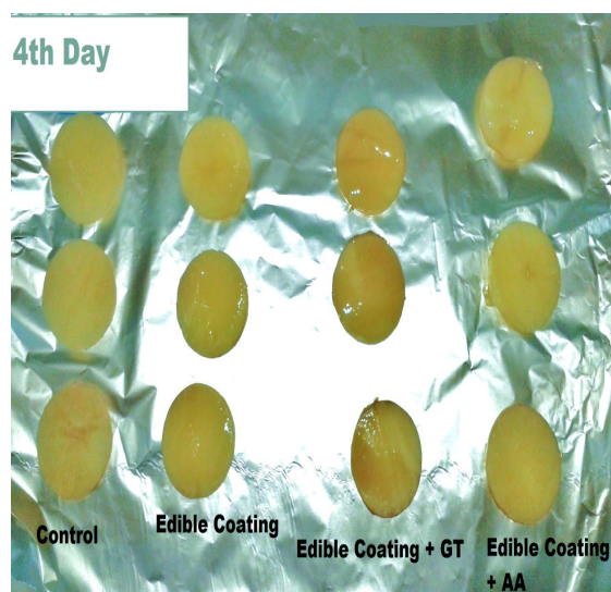
Fig. 2 Samples of potato slices after four days of storage in 4°C: a) control b) edible coating c) edible coating + GT d) edible coating + AA