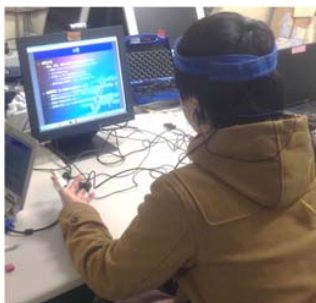
Fig. 1 Experimental environment

The encoder (ProComp Infiniti, Thought Technology Ltd.) can sample physiological data at 2048 s/s and 256 s/s via the sensors and electrodes, respectively. The sampled data were recorded on the PC.