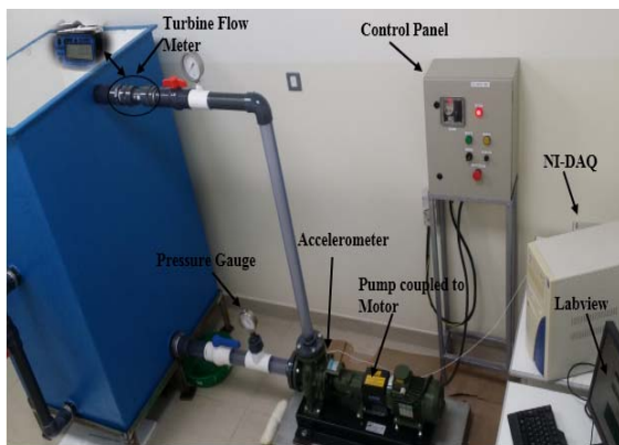
Fig. 1 Experimental setup

The centrifugal pump experiment has been designed and assembled specifically for this research where it consists of parts including: centrifugal pump which is coupled with a motor (Saer company, Italy, model: NCBZ-2P-50-125C, 2.2 kW, 3-phase, 420 V, head 8-17 m and flow rate 500-1000 L/M), control panel with speed controller (Schneider model VFD with speed controller and display screen, switch (OFF/ON) and emergency shutdown), digital turbine flow meter (USA-TM model, 2 inch diameter), pressure gauges, vacuum pump and clear PVC pipes; and spare parts: a rolling element bearing, mechanical seal, gasket and impeller. A data acquisition system (DAQ) and accelerometers from National Instruments (NI) are used. The DAQ system comprises SCXI-1000 and SCXI-1530 models. The accelerometer model is IMI 621B40 with sensitivity of 10 mv/g and frequency range from 3.4 to 18000 Hz for ( \pm 10\% ) and 1.6 to 30000 Hz for ( \pm 3 dB). Fig. 1 shows the centrifugal pump experimental setup which includes the products of NI.