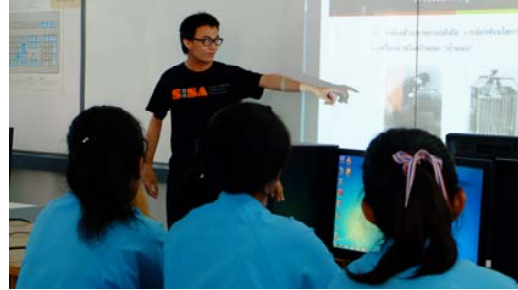
Fig. 5 Students from SISA share basic knowledge and skill in film production to the participant students before on-field activity