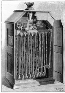
Fig. 1 Kinetograph