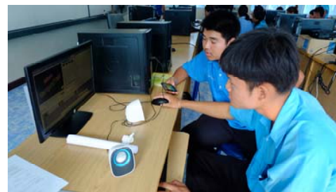
Fig. 7 Participant students learn how to edit video