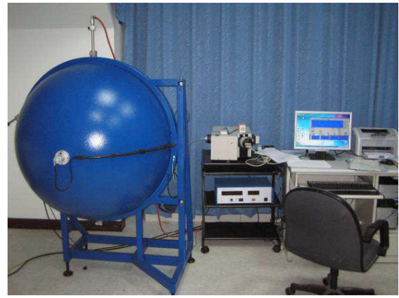
Fig. 2 Luminous flux measurement system