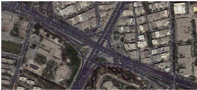
Fig. 2 Aerial Photo from Gisha bridge in Tehran City