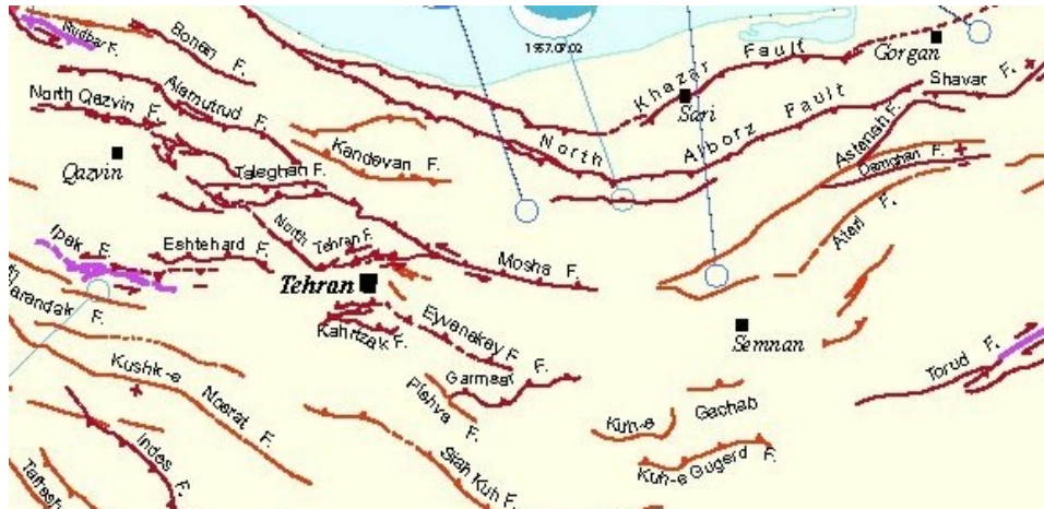
Fig. 1 Distribution of Faults around Tehran City