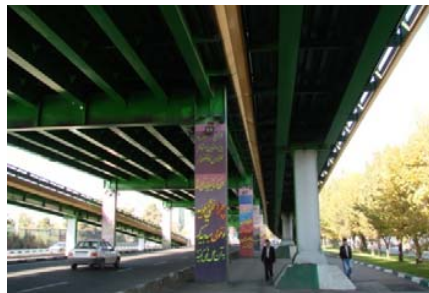
Fig. 3 Left Photo: South view of Gisha bridge, Right Photo: North view of Gisha bridge

The bridge deck material is steel and its structural system is categorized as an orthotropic class. In the main part of the bridge, the loads applied to the deck are transferred to the ground by two piers. This bridge consists of 24 spans with approximate length of 520 meters and has 4 lanes to facilitate automobiles traffic. The length of the longest span is 24 meters and is located where it passes over the Shahid Chamran highway. The skew angle ( \alpha ) of the bridge is considered to be zero. Abutments of the bridge are infilled and